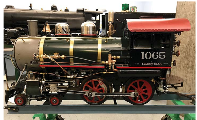
Cinder Ella. 12" gauge coal fired Owned by Glenn Brooks