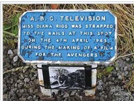
Film location plate presented by ABC TV to the Stapleford Miniature Railway, which is still in use today

Logo sweatshirts, hoodies, polos or tee shirts are available. The logo is large and centered (see example). You can choose color or style of the shirt you desire. We need to have a minimum order of 12 units, mix and match. If you would like to have one, please let Carole know, withane65423@gmail.com , so we can compile an order.